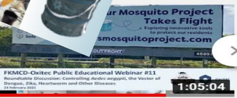
FKMCD - #Oxitec Public Educational Webinar #11 82 views • 2 months ago