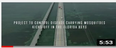
Project to Control Disease-Carrying Mosquitoes Kicks... 53 views • 3 days ago