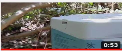
FKMCD - #Oxitec Mosquito Project Update: Emergenc... 2.1K views • 1 week ago