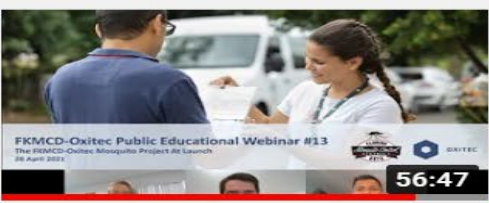
FKMCD - #Oxitec Public Educational Webinar #13 64 views • 3 weeks ago