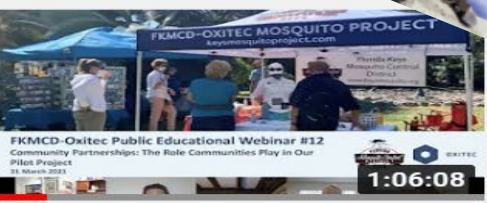
FKMCD - #Oxitec Public Educational Webinar #12 48 views • 1 month ago