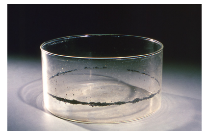
Aedes aegypti mosquito eggs