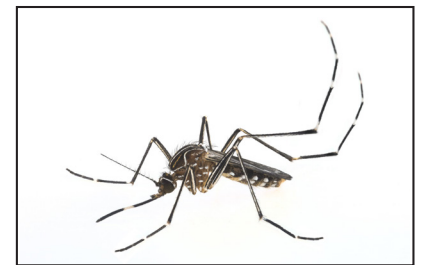
Aedes notoscriptus (Australian Backyard Mosquito)