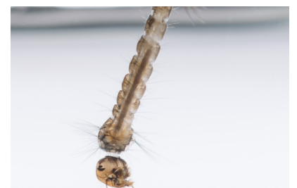
Aedes notoscriptus mosquito larvae