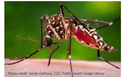
Aedes aegypti (Yellow Fever Mosquito)