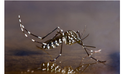
Aedes albopictus (Asian Tiger Mosquito)